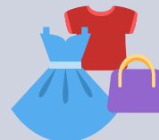
Clothes & Accessories